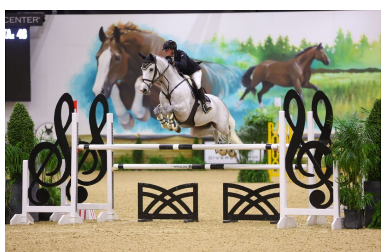
Megan Bash and Jackson VDL were victorious in the $10,000 WEC -Wilmington Welcome Stake.